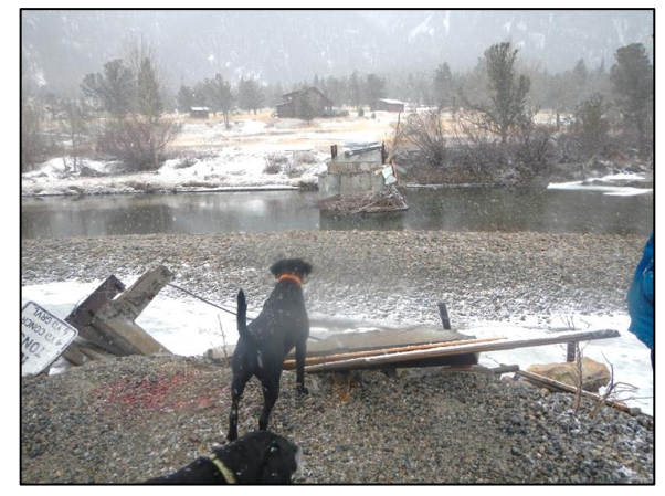
Figure 4. Upper Stillwater Bridge failure (RM 39.3); bridge provided the primary access route for the Rainbow Ranch Subdivision.