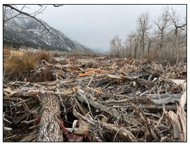
Figure 3. Example debris accumulation on upper Stillwater.